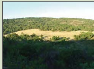
Red Hill Nature Reserve before this years fires.

There are a number of threats to the park, some of which are being managed. Watsonia weed control has taken place in the park since 2002 and has covered about 200m along the riparian zone each year. The aim is to completely eradicate the Watsonia in the riparian zone of Susannah Brook this year. Other weeds present in the park are Paterson's Curse, where a biological control (a small moth) is helping reduce its spread. The moth is killed off by chemical control and here we see an example where non-chemical weed control is working well. The Cape Tulip weed is also present in the park. Other pressures to the park include