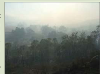
Red Hill Nature Reserve during this years fires.

Currently a developer is working with DEC in an offset re-vegetation program that funded weed control in Autumn 2010, and will also provide for the proposed planting of 5000 seedlings this year. Where the Watsonia has been controlled, natural regrowth is occurring nicely. In addition, volunteers have installed nesting boxes for homes for the Carnaby's Cockatoo and other birds, as well as possums. Lace Monitors and echidnas have also been sighted in the reserve.