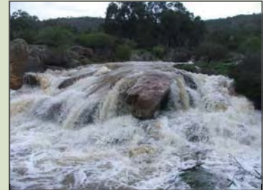
First waterfall in full flow, July 2007.

Red Hill Nature Reserve is located in the Susannah Brook Catchment and bounded by Macham and Crimosa Roads that run north south along the Darling Scarp. Susannah Brook runs through the park and joins the Swan River near River Rd, Millendon. The park covers a total of 278Ha and contains a number of beautiful walk tracks and gorgeous flowing seasonal waters to enjoy. The reserve has been recognised as an "A Class Nature Reserve" for just the past 18 months.