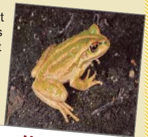
Motorbike Frog

A holistic view of habitat gardens—not just frogs! In this workshop you will learn about the biology of the frog, how to make a frog friendly garden and have a look at other animals that gardens attract, such as native bees, butterflies and what to plant to attract them.