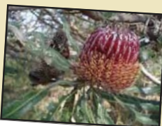
Firewood Banksia ( Banksia Menzeisii )

Join us in the fight against Phytophthora Dieback. Come and learn how you can make a difference through practical experience in dieback treatment. Skill up and protect your local bushland.