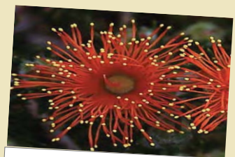
Eremaea Pauciflora

A talk on chemical/ herbicide use in the environment and the implication of their use. Followed by hands on weed management and advise on how to remove and treat invasive grasses, watsonia, arum lily, Arundo donax and Blackberry (time permitting).