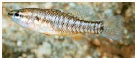
BALSTON'S PYGMY PERCH