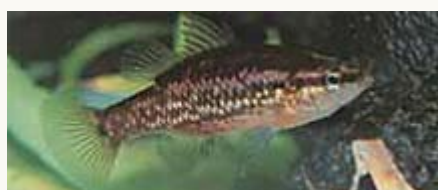
WESTERN PYGMY PERCH

Bostockia porosa (Hill River to Kalgan River)