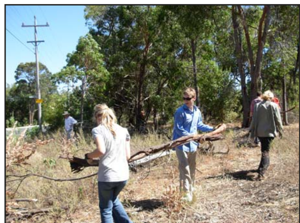
Volunteers at work removing woody debris

If you are interested in becoming a proactive environmental volunteer or undertaking activities relating to bushland management in the Shire of Kalamunda please contact the Environmental Reserves Officer on 9257 9999.