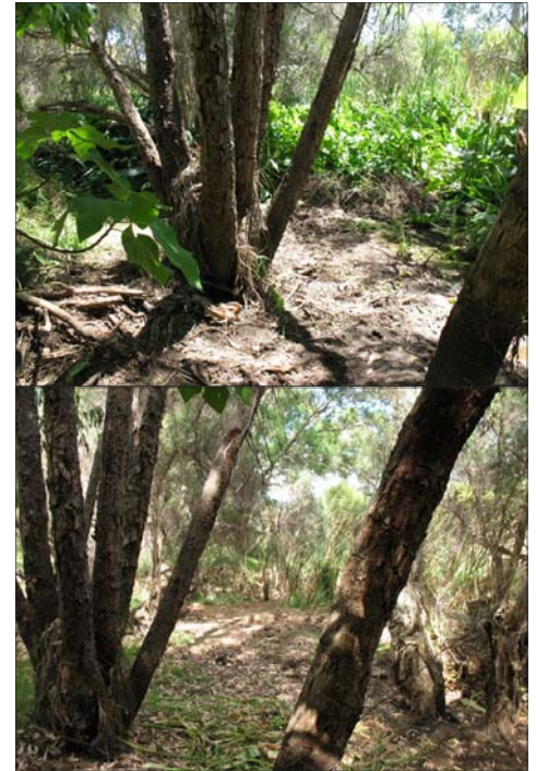
Before and After monitoring photographs of the Arum Lilly project site along the Blackadder Creek

Three successful community days were hosted throughout the year. One was a final weeding day at Spring Ave where all members were invited to come and have a look at the work that had been achieved through the Community Water Grant. A final weeding and planting day was held at the Elvire St where sedges were planted and weeding was continued. It was a productive day and those who attended were impressed with the work that had been achieved. The annual National Tree Day was again a great success with the BWCG hosting the only event in the local Midland area attracting 25 people and recruiting 5 new members.