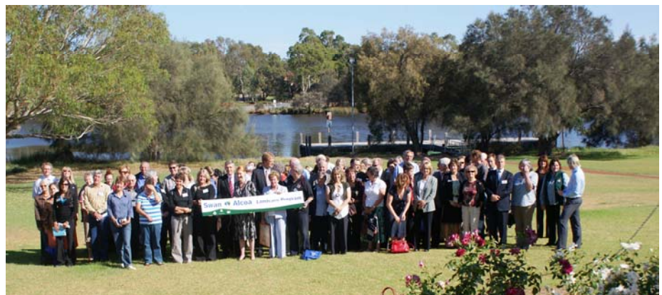
2009 SALP Recipients

The 2009 SALP celebration breakfast was held in late February, where cheques were handed to successful community groups, and marks the start of another busy year of on-ground activities for the Eastern Hills