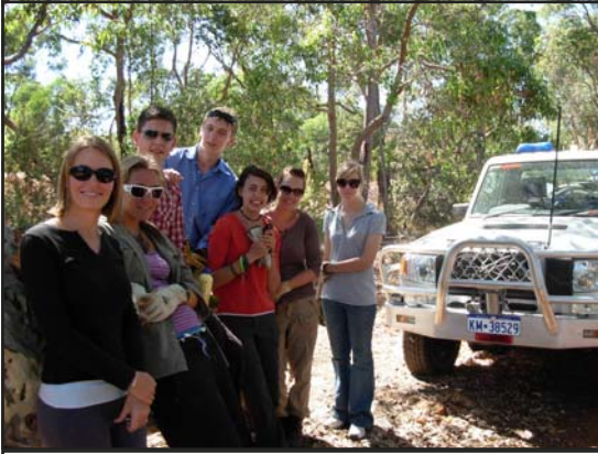
The Conservation Volunteers Australia Team

Over the course of the week commencing on the 16 th February a crack team of environmental volunteers from Conservation Volunteers Australia (CVA) were teamed up with members from the Rangers Fire Protection crew to reduce the existing fuel loads present along sections of the Railway Heritage Trail Reserve. The works gang was further supplemented with eager community members from the Friends of the Railway Reserve and the Kalamunda Volunteer Fire and Rescue Service.