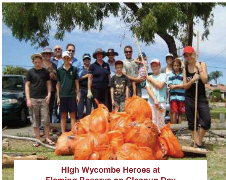
High Wycombe Heroes at Fleming Reserve on Cleanup Day

Saturday 20 th February 2010 saw 14 volunteers join in at Fleming Reserve to clean up the Park, putting in a total of 18½ hours together. Our High Wycombe Heroes worked through the bushland and the skate park to collect up more than 20 bags of rubbish, as well as pieces of metal and wood; damaged signs; and a football. This reserve is about to undergo a massive re-development which has been championed by the High Wycombe Ratepayers Association. Community involvement is crucial, and this event shows that the community are willing to get involved, with plenty more opportunities still to come.