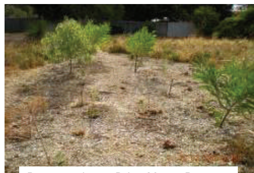
Revegetation at Brine Moran Reserve

The Friends of Brine Moran's efforts of the past two years in one section of the reserve on the Scarp are withstanding the hot weather and growing strongly. Some of the trees used for revegetation are Alcoa supplied Dieback Resistant Jarrah. Another Eastern Hills success!