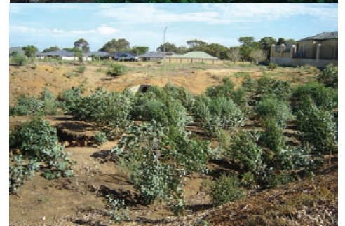
Poison Gully, Pinker Crescent, High Wycombe showing BEFORE (May 2008) and AFTER (February 2010) cleanup and revegetation funded by a grant application.

As the Swan Alcoa Landcare Grants for 2010 are given out to successful groups at the end of February, some groups will be al-