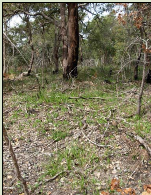
Brine Moran Reserve regenerating after a prescribed burn

Although you would never choose to burn for this purpose, a burn can be a good opportunity to control weeds. It often encourages germination of the weed seed in the soil, as well as encouraging native regeneration. The reduced biomass and softer new growth can mean the need for far less chemicals to be used for weed control. In some cases, lower rates of chemicals can also be used to provide effective control. Less tangled vegetation can mean it is easier to target weeds with less off-target damage (damage to native plants).