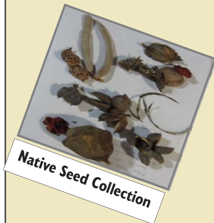
Native Seed Collection